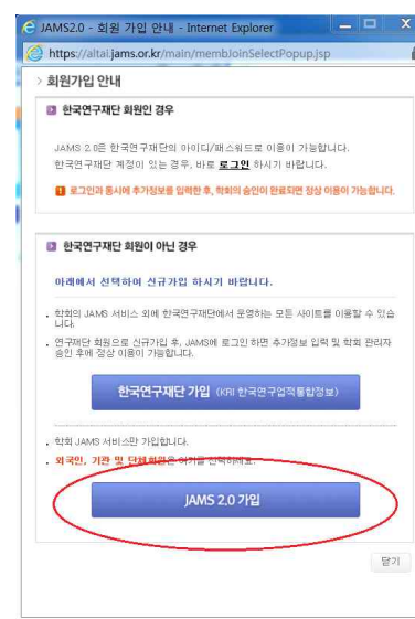
Figure 图 图 2

нажать [JAMS 2.0 가입], отмеченное красным кругом на рис. 2;